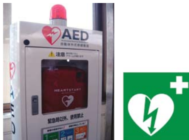
FIGURE 4. An automated external defibrillator stand in an Airport in Japan (left) and the 'universal AED sign' adopted by the International Liaison Committee in 2008 to indicate the presence of an AED (right) 39 .

PAD programs are now widespread in many countries. In September 2008, the International Liaison Committee issued a 'universal AED sign' to be adopted throughout the world to indicate the presence of an AED (Fig. 4). 38 To maximize the effectiveness, community lay rescuer AED programs